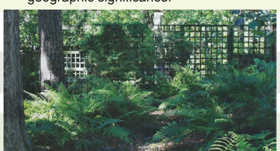
RUSTON, LA Native Shade Garden; Design by A.Wreden www.workingdesign.info

Allow your landscape to reflect its cultural and geographic significance!